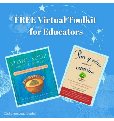
Sept 21: FREE Virtual Toolkit for Educators In the spirit of Tikun Olam (repairing the world), we are offering a FREE Virtual Toolkit for Educators. Please share and follow us on Social Media. #StoneSoupLeader #Educators #Schools